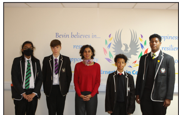
Achievements Outside College