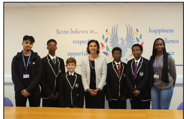
A Great Start to the Academic Year