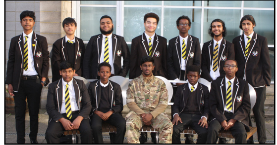
KS4 College Council Representatives

“On Tuesday October 4th, Year 11 geography students visited Worthing beach to complete the fieldwork element of the course.