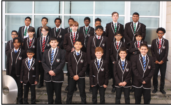
KS3 College Council Representatives

The College Council consists of representatives from each year group. Council members are selected by their peers and meet regularly with senior members of staff, passing on information from their classmates and ensuring that all students have a voice.